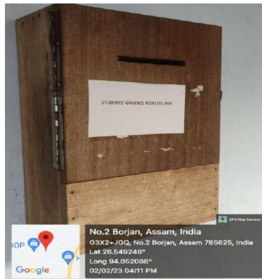
Photo of Grievance box