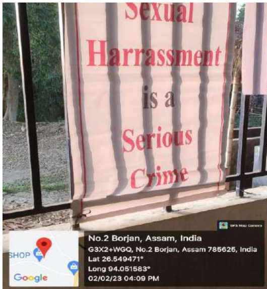
Awareness on Sexual Harassment