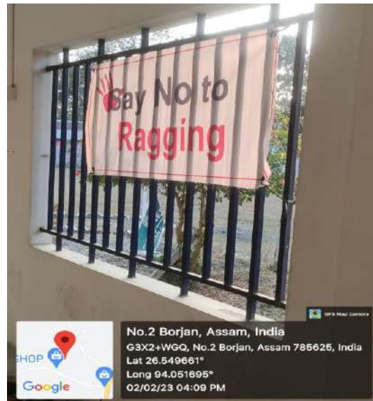
Awareness on Anti ragging